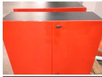
Machinery Tool Storage