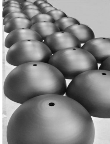
Powder Coating Light Fixtures